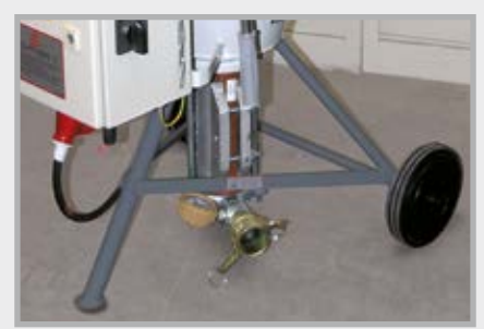
Discharge connection with pressure gauge for connecting mortar hoses