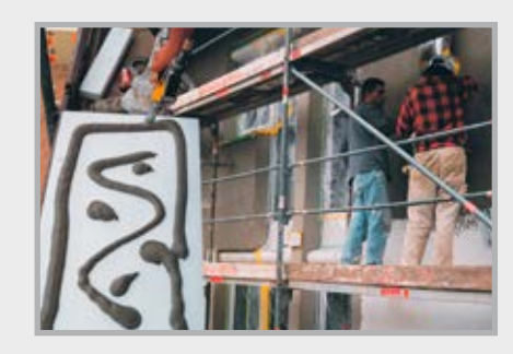
Practical accessories for a range of applications