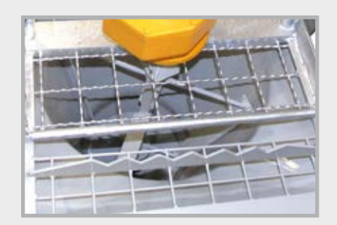
Mixing, pumping and spraying from a single material hopper